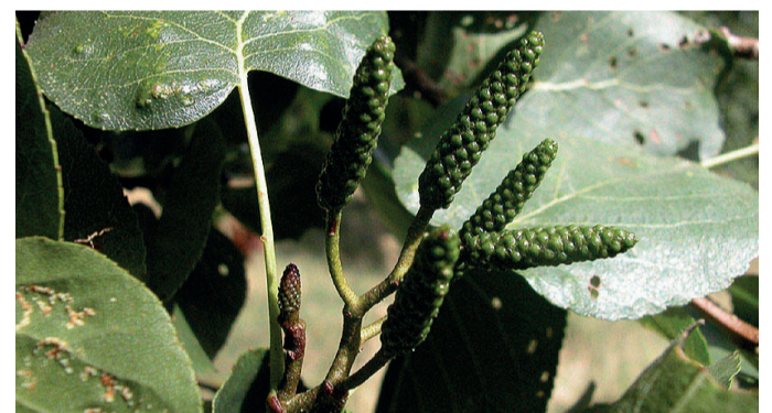
Maturing catkins during mid summer: they appear in early summer, are dormant in winter and are fully functional at the end of winter.

more frequent on plantations outside the natural area range, even if in general pathogens affecting the Italian alder are of limited importance 11 . Root system damage is reported by fungi Armillaria spp., Phytophthora alni and Cryphonectria parasitica 11, 15-17 . In northern Europe a new species of genus Phytophthora is affecting foliage and causing bark necrosis, recently also spreading in the Mediterranean region 11, 18 . Insect pests Cossus cossus , Zeuzera pyrina and Saperda scalaris affect the cortical zones of plants in precarious health conditions 1, 11 . In natural ranges actually the main threats endangering Italian alder are the reduction of clear cutting in mixed forests and in protected areas, heavy and unauthorised grazing in forests, and the isotherm shift in the Mediterranean regions. The possibly increase in temperature due to climate change may force alder ecosystems to shift to higher elevations in restricted areas 5 .