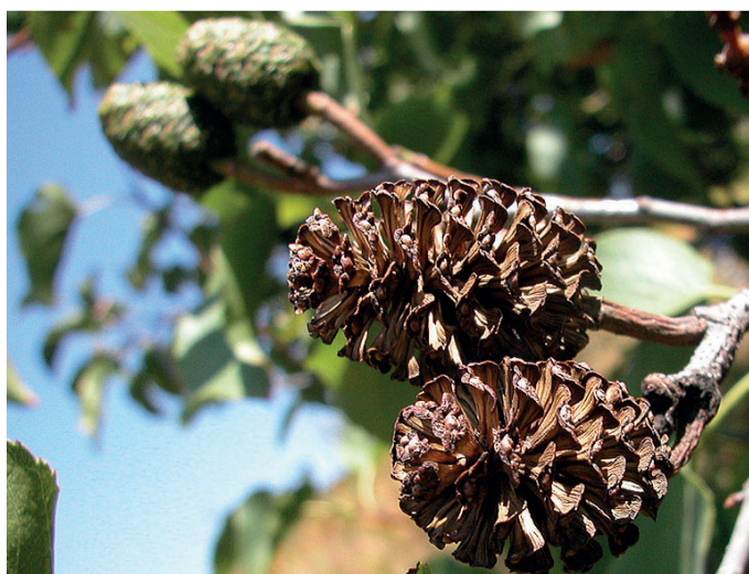
Old woody fruits (pseudo-cones) which persist on the plant while new ones are maturing.