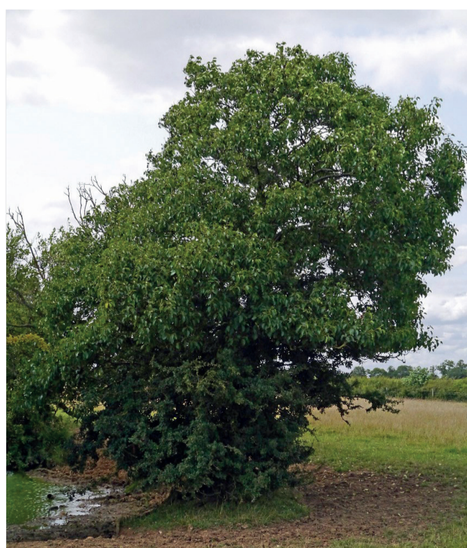
Italian alder in the Soar valley, Leicestershire, UK.

This is an extended summary of the chapter. The full version of this chapter (revised and peer-reviewed) will be published online at https://w3id.org/mtv/FISE-Comm/v01/e015443 . The purpose of this summary is to provide an accessible dissemination of the related main topics.