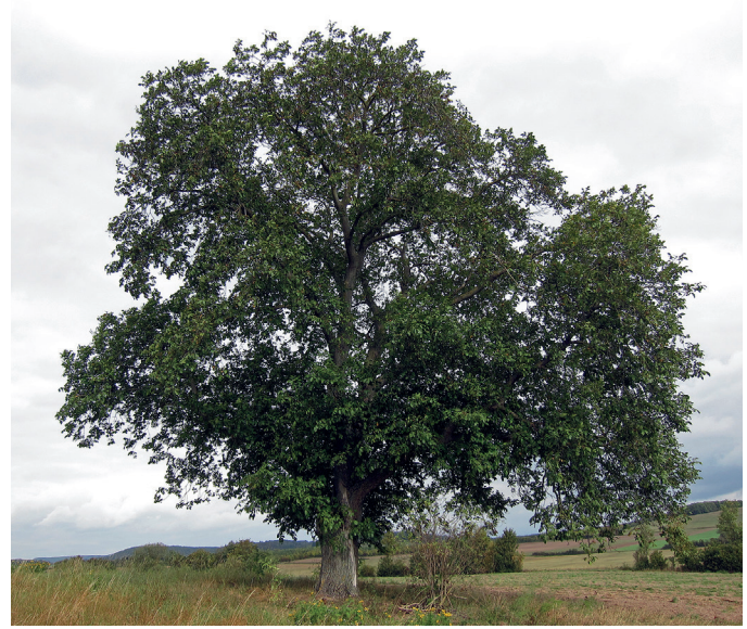
.... Mature walnut tree with large spreading crown (Bavaria, Germany).

The common walnut (Juglans regia L.) is a large, deciduous tree, reaching a height up to 25-35 m and exceptionally a maximum trunk diameter up to 2 m<sup>1</sup>. It is long-lived: normally 100-200 years, but some specimens may reach 1000 years old<sup>2</sup>. It has a deep root system, with a substantial tap root starting from the juvenile stage<sup>1, 3</sup>. The bark is silver-grey and smooth between deep, wide fissures<sup>4</sup>. The leaves are 20-45 cm long, with 5 to 9 leaflets, the ones from the apex being larger compared with those from the base of the leaf<sup>4</sup>. Crushed leaves have a scent like shoe-polish<sup>4</sup>. The crown diameter of the common walnut is larger in relation to its stem diameter than any other broadleaf tree species used in Europe<sup>5</sup>. The fruit ripens during hot summers and is a large rounded nut of 4-5 cm and weighing up to 18 g<sup>6</sup>. It may be propagated both by seeds and also vegetatively. It can hybridise and it has been found that the hybrids between common walnut and black walnut (Juglans nigra) have good vigour and form<sup>3</sup>.