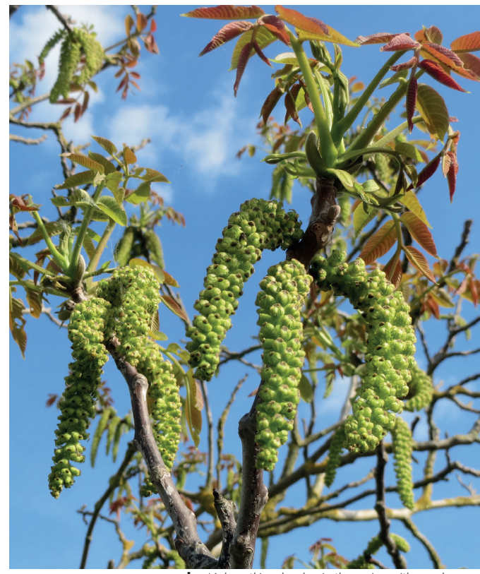
Male catkins develop in the spring with new leaves

increase the insulin level in diabetic patients<sup>21</sup>. The wood of the walnut is highly prized, being strong, attractive and easy to work. Good quality logs are sold for veneer and can command high prices7. It is also used in agroforestry7, 12, 22.