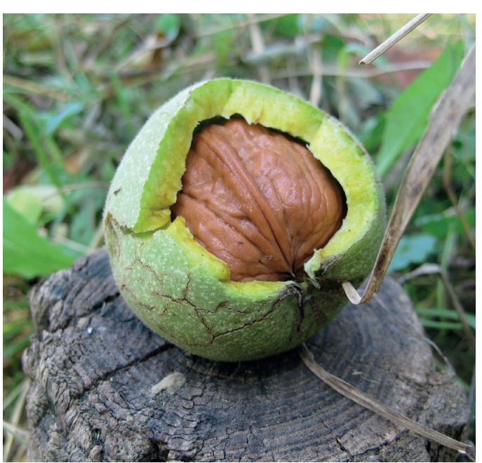
The ripe walnut, emerging from the fruit.

Walnut is very appreciated for its nuts, which are a highly nutritious food source. They are rich in oil composed of unsaturated fatty acids, proteins, vitamins and minerals. The kernels contain a wide variety of flavonoids, phenolic acids and related polyphenols, which have good antioxidant, antiatherogenic, anti-inflammatory and anti-mutagenic properties16. A diet rich in walnuts is also thought to have a cardiovascular protective effect<sup>17, 18</sup>. Bark or leaf extracts are used worldwide in traditional medicine to treat a variety of conditions including fungal infections such as Candida, to inhibit the growth of bacteria responsible for dental plaques and oral hygiene problems<sup>20</sup>, or to