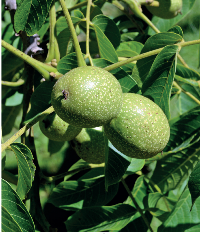
Fruits ripening on the tree

Because of its long history of cultivation, the natural distribution range of this species is not clear<sup>7, 8</sup>. It is thought to be native to the Mediterranean (Southern Europe, Western Asia) and Central Asia<sup>9</sup>; in the latter area the mountains of the West Himalayan chain in the Kashmir, Tajikistan and Kyrgyzstan are considered to be its centre of origin<sup>2</sup>. Fossil evidence, however, shows that in some putative areas of origin in Central Asia such as Kyrgyzstan, the species was introduced for agricultural purposes only 1000-2000 years ago<sup>10</sup>. Pollen records and nutshell finds show earliest cultivation in the Mediterranean area; e.g. in Italy around 6 000 years ago and in Anatolia, north-eastern Greece and Croatia around 4000 years ago<sup>11</sup>. It has been widely cultivated