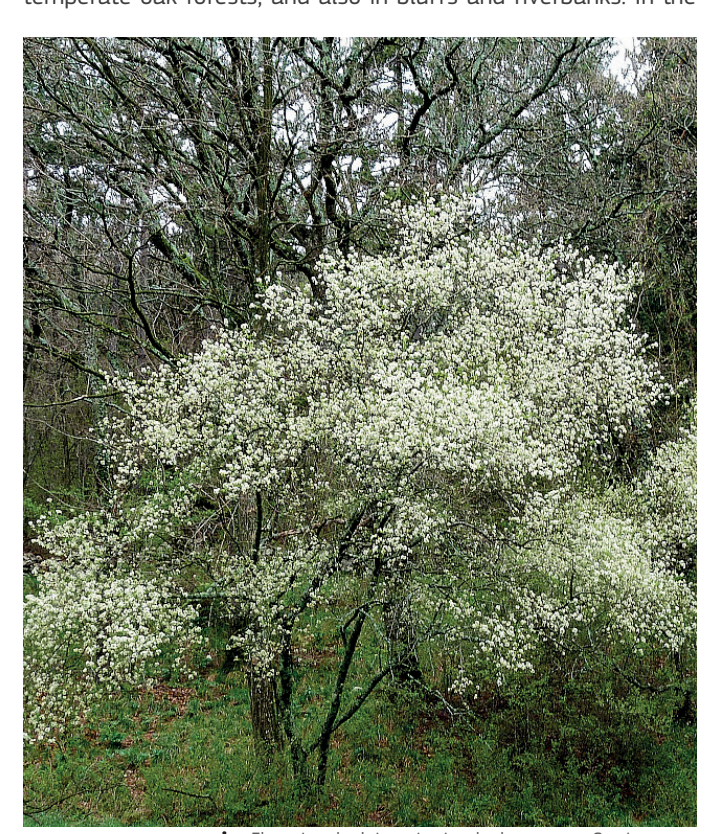
Flowering shrub in spring in a hedgerow near San Lorenzo (Trieste, North-West Italy).

The mahaleb cherry is a thermophile and pioneer species, growing on warm, sunlit and dry slopes at middle elevations. It tolerates Mediterranean and temperate dry climates with an annual precipitation of 500-600 mm. It is not sensitive to frost. It grows better on calcareous soils with pH 5.5, in stony and rocky sites<sup>1, 3, 5, 18</sup>. It is slightly shade tolerant only at young stages; when mature it is a high light-demanding species<sup>5</sup>. The fruit production is controlled and proximal flowers (first to open) have advantages in maternal resource capture; the first fruits to develop have an advantage over the later developing fruits9, 10. This species thrives in open woods, at the margins of temperate oak forests, and also in bluffs and riverbanks. In the