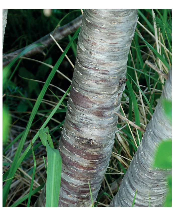
... Bark is smooth grey-brown with horizontal strips that pull away