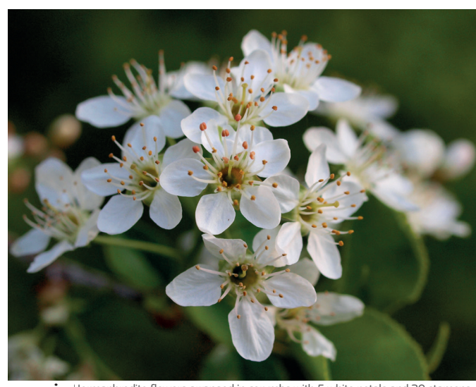
· · · Hermaphrodite flowers arranged in corymbs with 5 white petals and 20 stamens

The mahaleb cherry is susceptible to fungi such as bracket fungus (Laetiporus sulphureus) and witches' broom (Taphrina cerasi) on its trunk and branches. The rust fungus Tranzschelia discolor a relatively common parasite on its leaves, or Taphrina minor which causes shrinkage and reddish-brown discoloration of affected leaves. and Phloeosporella padi causing leaf spots on infected leaves<sup>5</sup>.