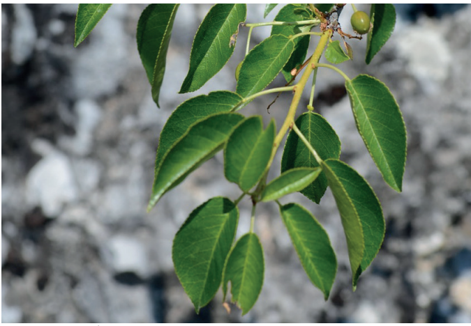
· · · Ovate simple leaves with pointed tips and finely toothed margins